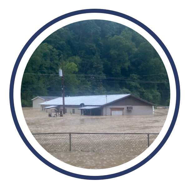
Manna from Heaven during the flooding.