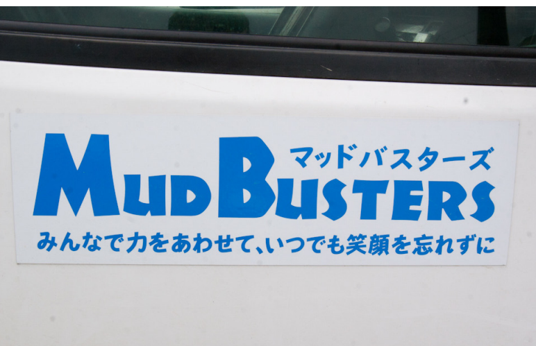
Top: the signage on a Peace Boat van, which describes, in humorous English terms, an important aspect of the volunteers' work.

To date, Peace Boat volunteers have cleaned 885 homes or shops of mud and debris, including 125 in July 2011. Contributing to the re-opening of many businesses and shops, to date, 95% of requests have been responded to and completed.