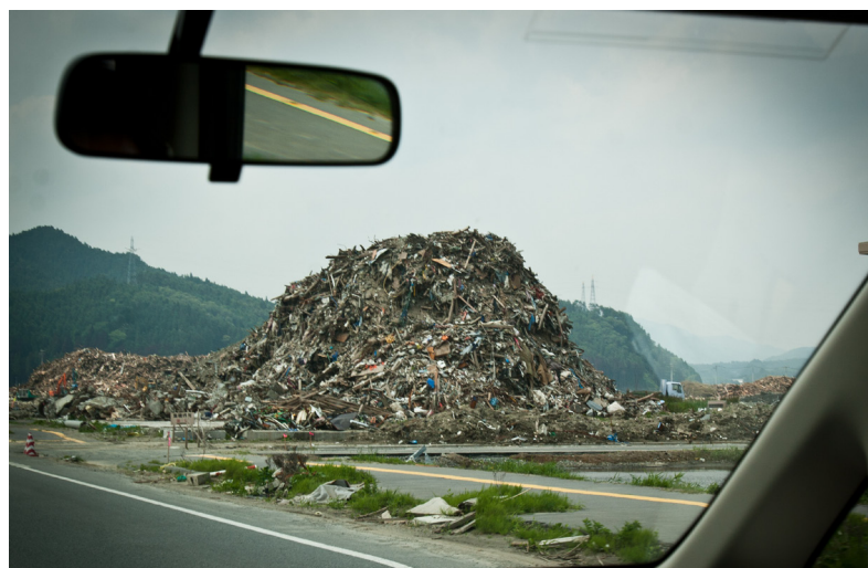
Above: Piles of debris, mostly sorted into different types of materials, line the road in Ishinomaki city. Slowly the city is being cleared of such sites, though much work remains to be done for the months, if not years, ahead.

In some areas of the three prefectures hit hardest by the March 11 earthquake and tsunami – Fukushima, Miyagi and Iwate – tourists remain scared away. Inawashiromachi, in Fukushima prefecture, for example, has been shunned by tourists due to unfounded radiation fears, even though the town is more than 45 miles from the crippled Fukushima nuclear power plant. But in other areas, tourism is slowly increasing. Hirai-zumicho, in Iwate, has been a magnet for visitors since Chusonji temple and other historical sites in the town were recently granted UNESCO World Heritage status.