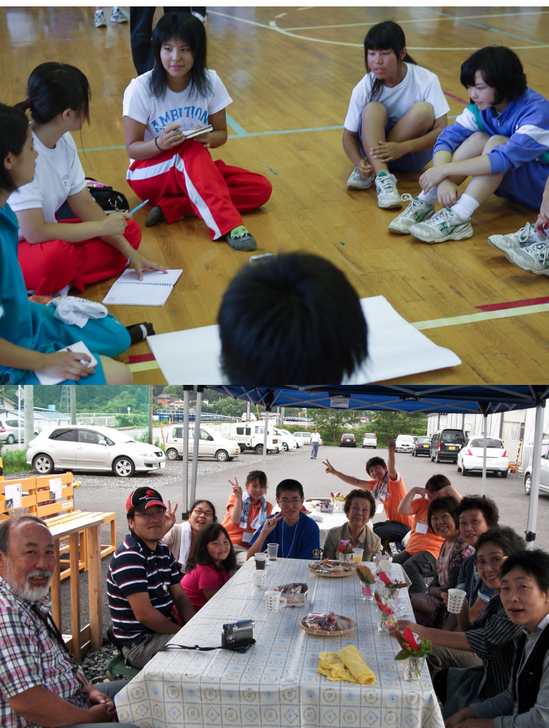
Top: students from Ooya Junior High School in Miyagi and Maiko High School share views on Ooya district’s reconstruction plan. Bottom: SEEDS Asia staff and KRA coordinators with temporary housing residents at a Hamarain Café tea party in Sorimatsu Park.

Through Oxfam Japan, CWS has been helping the Single Mothers Forum (SMF), a Japanese NGO, to run a hotline for women seeking psychosocial support. SMF has also been providing relief items not provided by the government, such as women’s hygiene items and underwear, and has initiated women-safe spaces in evacuation centers to ensure women’s privacy is respected. These evacuation centers closed at the end of July, so SMF is making efforts to keep contact with the women