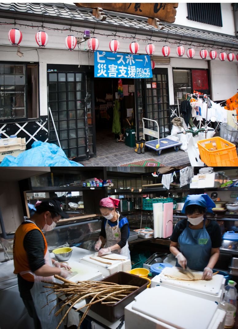
Top: Peace Boat's central kitchen in Ishinomaki city, named Kouzan, which, in July, supplied most of the hot 14, 146 meals delivered to 26 locations around the city. Located at a former Izakaya, a kind of bar that also serves food, Kouzan also houses Peace Boat's administrative office. Bottom: some of Peace Boat's seven full-time staff prepare food inside Kouzan for distribution to evacuation centers and temporary housing units.

During the initial phase of the disaster, through NICCO, CWS provided static and mobile health services to thousands of evacuees, who were able to receive critical medical assistance in Natori and Iwanuma cities of Miyagi Prefecture, and in Rikuzentakata city of Iwate prefecture.