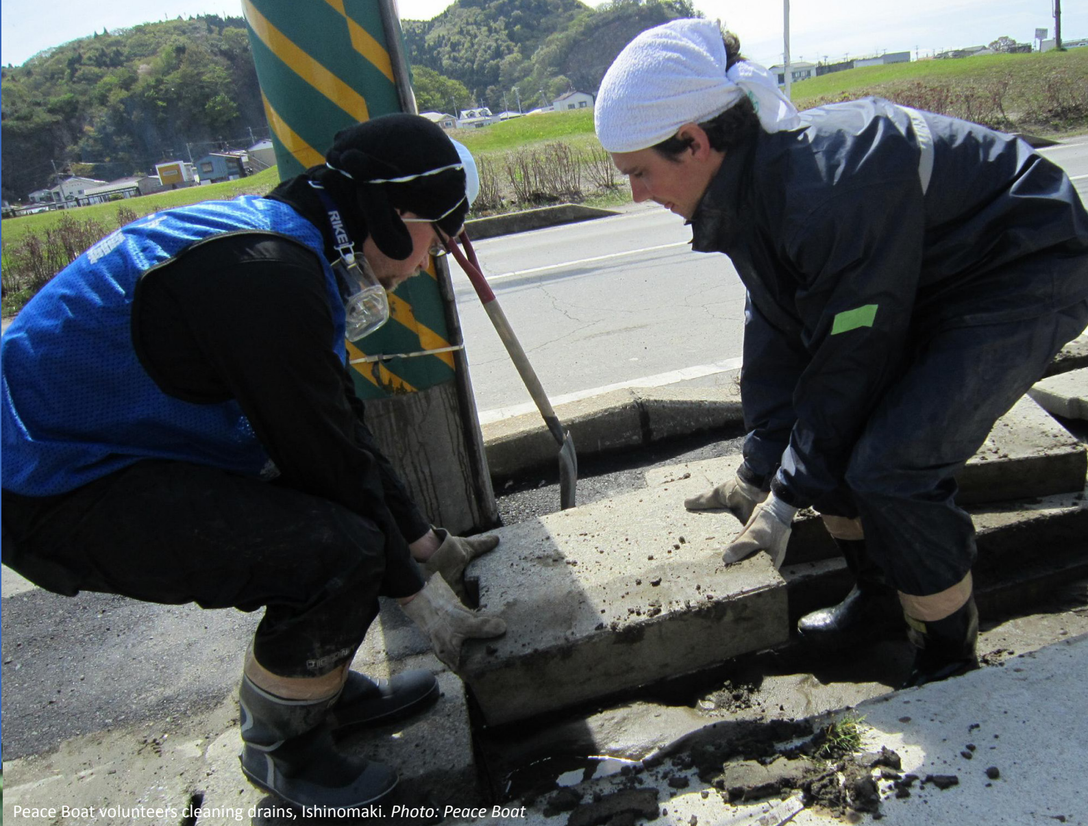
Peace Boat volunteers cleaning drains, Ishinomaki.

very much! The reason that Ishinomaki is now able to be making moves towards recovery is thanks to the great energy that was given to us by the volunteers helping with the clean up. We just cannot express enough of our thanks. We apologise for mailing you just to send one single photo like this. Thank you so much.”