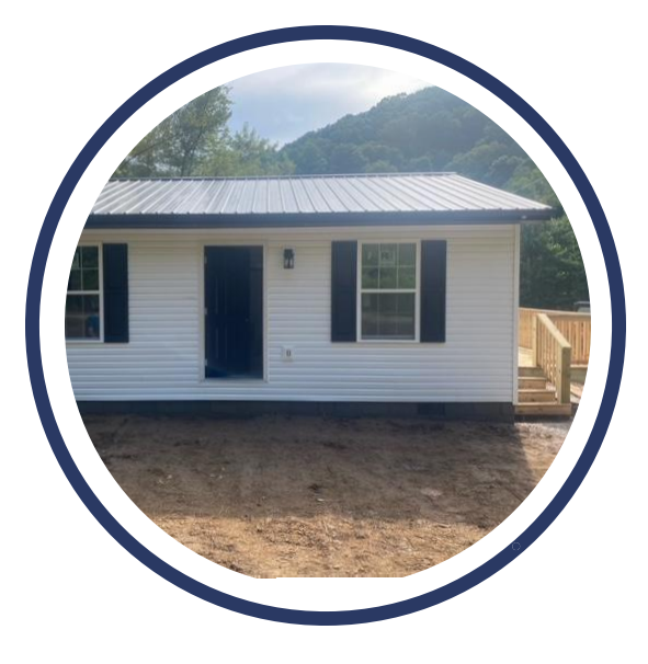
A rebuilt house in eastern Kentucky.

In December 2021, western Kentucky was hit by a series of deadly and destructive tornadoes, destroying over 1,300 homes. In July 2022, recordsetting floods inundated communities in eastern Kentucky. The flooding caused heavy damage to homes and local infrastructure. Recovery in both areas will takes years.