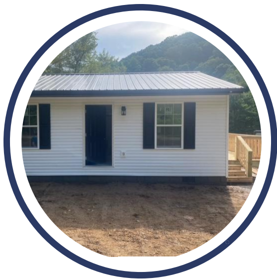
A rebuilt house in eastern Kentucky.