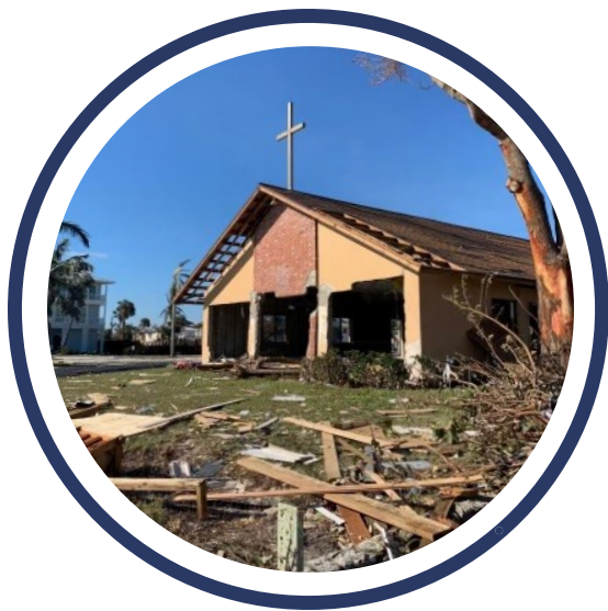
St. Peter Evangelical Lutheran Church in Fort Myers Beach, FL