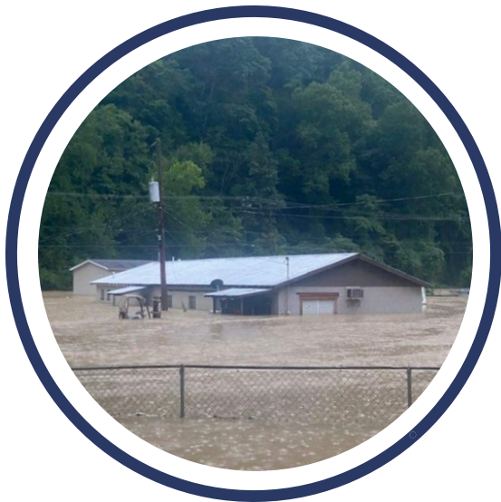
Manna from Heaven during the flooding.