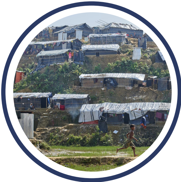
Cox's Bazar

Through implementing partner RDRS Bangladesh, Lutheran Disaster Response is supporting a response to the fires. RDRS is distributing non-food items, such as kitchen utensils, mosquito nets, and traditional clothing to Rohingya beneficiaries. They are also offering cash-for-work opportunities to clean and repair structures and provide an income for affected people. Additionally, trees will be planted in damaged and deforested areas to prevent future soil erosion, flooding, and landslides.