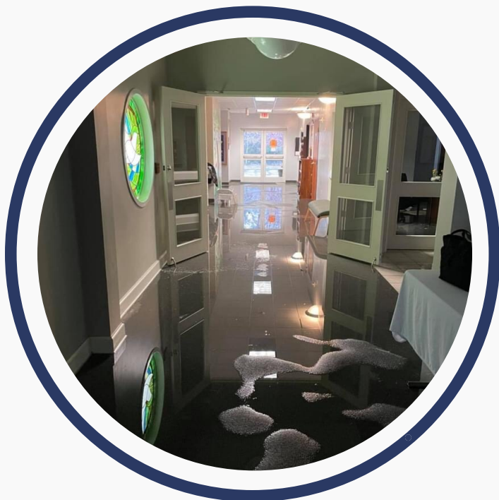
Spirit of Joy! Lutheran Church The Woodlands, TX

The Texas-Louisiana Gulf Coast Synod is one of the groups responding to the immediate needs of storm survivors. The synod is providing food and water supplies and helping families secure temporary shelter and utility assistance with the support of Lutheran Disaster Response and donors in their synod. They are also accompanying congregations in African-American, Latinx, and immigrant neighborhoods by using assistance models developed during the COVID-19 pandemic to serve impacted people. LDR also hosted a flood clean-up webinar for the three Texas synods. We are looking ahead to a long-term response with the synods and Lutheran Social Services Disaster Response.