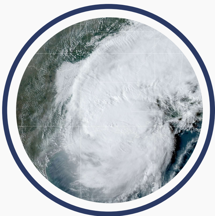
Hurricane Delta

Lutheran Disaster Response is engaging with Lutheran Social Services Disaster Response (Upbring) and the Northern Texas-Northern Louisiana, Texas-Louisiana Gulf Coast and Southwestern Texas synods to respond to Hurricanes Laura and Delta, providing relief and assessing needs as they look ahead to long-term recovery in the area. Following Hurricane Sally, under the leadership of the Southeastern Synod, the synod and Inspiritus are working together to provide relief and clean-up assistance to survivors in Baldwin County, Alabama. Additionally, the Florida-Bahamas Synod is distributing relief supplies to survivors in Pensacola, Florida.