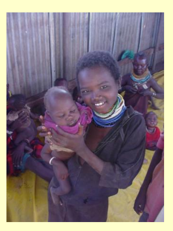
Kenyan mother and child

It has also meant that the LWF/DWS country programs are among the few actors with an ability to respond quickly, while at the same time making assessments for a possible large scale intervention. The fund has typically been used as a "guarantee" - while the actual cash has been pre-financed by the respective LWF country programs to further increase the speed of the response.