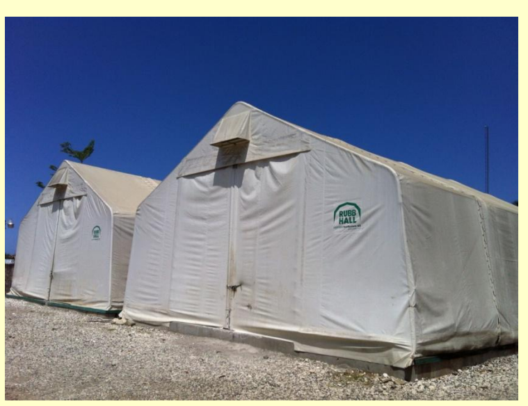
Rubb Halls in the LWF/DWS Léogane base in Haiti

The LWF/DWS Program in Kenya has a similar agreement with the Kenyan Government under the same conditions.